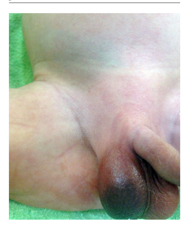
Figure 1. Swelling and bluish discoloration of the right groin and hemiscrotum

entubation at birth and had evidence of multisystem hypoxic ischaemic insult. On sixth day of life, a bluish discolouration and swelling appeared in the right scrotum (Figure 1). Scrotal ultrasound showed a right scrotal haematoma with normal testis (Figure 2). Abdominal ultrasound revealed bilateral suprarenal cystic masses suggesting adrenal haemorrhage. Blood count showed: hemoglobin 16.2 g/dl, hematocrit 51%, white blood cells 25 000/mm<sup>3</sup>, and platelets 269 000/mm<sup>3</sup>. Prothrombin time and activated partial thromboplastin time were normal. The infant was managed conservatively with a plan to monitor the mass with regular ultrasonographic examinations. Follow-up ultrasound showed decrease in the size of adrenal haemorrhage with complete resolution. Test results showed no abnormality in the hypothalamic-adrenal axis and adrenal functions.