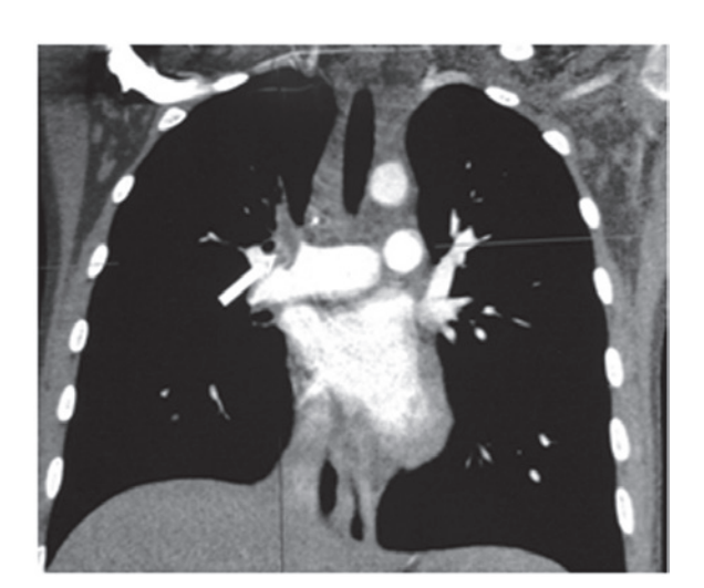
FIGURE 2. Thrombi with partial flow at right lower lobar artery and segmental arteries of left lower lobar artery

FIGURE 1. Thrombi with partial flow at right upper lobar artery